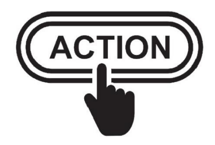
Something to do